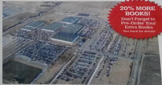
Aerial view of the 2014 43rd Annual Rocky Maginelli swap meet held in Lincoln, NE

(Full Page Bleed Size: 6.25" x 10.75", Trim Size: 6" x 10.5")